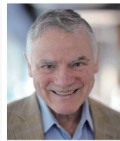
Leroy Hood, M.D., Ph.D. (Institute for Systems Biology, USA)