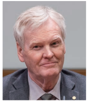
Michael Young, Ph.D. (Rockefeller University, USA) *2017 Nobel Prize Laureate