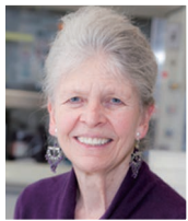
Joan Steitz, Ph.D. (Yale School of Medicine, USA)